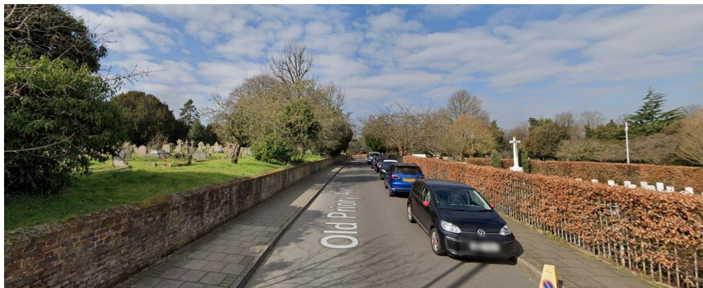
All Saints Churchyard (left) & Extension (right), Orpington