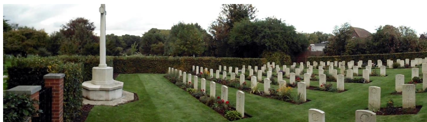
All Saints Churchyard Extension, Orpington